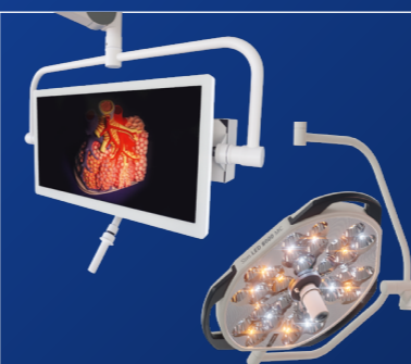
Camera & Video Systems Sim.CAM 4K Wireless Sim.CAM HD und HD Wireless