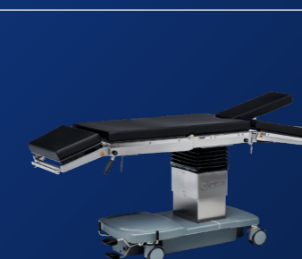
Mobile operating tables – Sim.MOVE