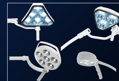
Examination Lights – Sim.LED 3500+ Sim.LED 3000 Sim.LED 350 Sim.LED 250