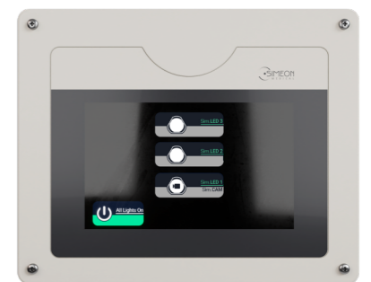
Touch Wall Control for Sim.LED 8000