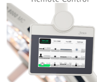
Touch Control Sim.LED 8000