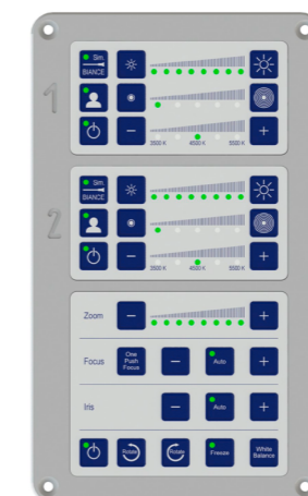
Wall Control for Sim.LED 7000/5000 and BusinessLine