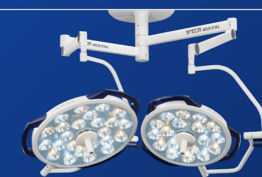
Surgical Lights – SIMEON BusinessLine Sim.LED 700 Sim.LED 500 Sim.LED 450