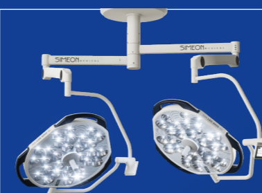
Surgical Lights – SIMEON HighLine Sim.LED 8000 Sim.LED 5000

SIMEON Medical offers a wide product portfolio for the operating room as well as for other major areas of the hospital. From surgical lights and examination lights to camera- and video-systems, to the operating table and all the way to ceiling supply units – everything from a single provider and always focusing on user-friendly application on site.