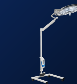
SIMEON Lights as mobile version, optionally with unique battery back-up