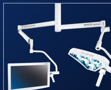
Minor Surgical Light – Sim.LED 4500